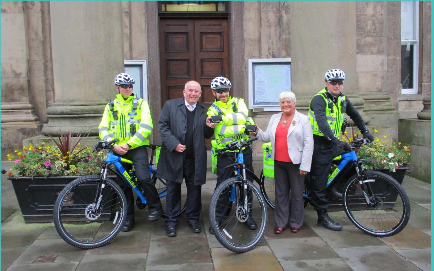
BOBBIES ON THE BICYCLE BEAT New community police bikes come in to use

MACCLESFIELD COUNCIL COMMUNITY NEWSLETTER