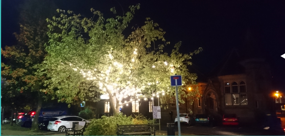
This cherry tree is at the junction of old Park Lane and Park Green....