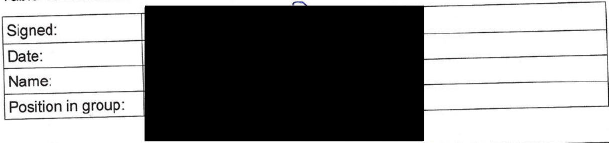
Table 13 Declaration