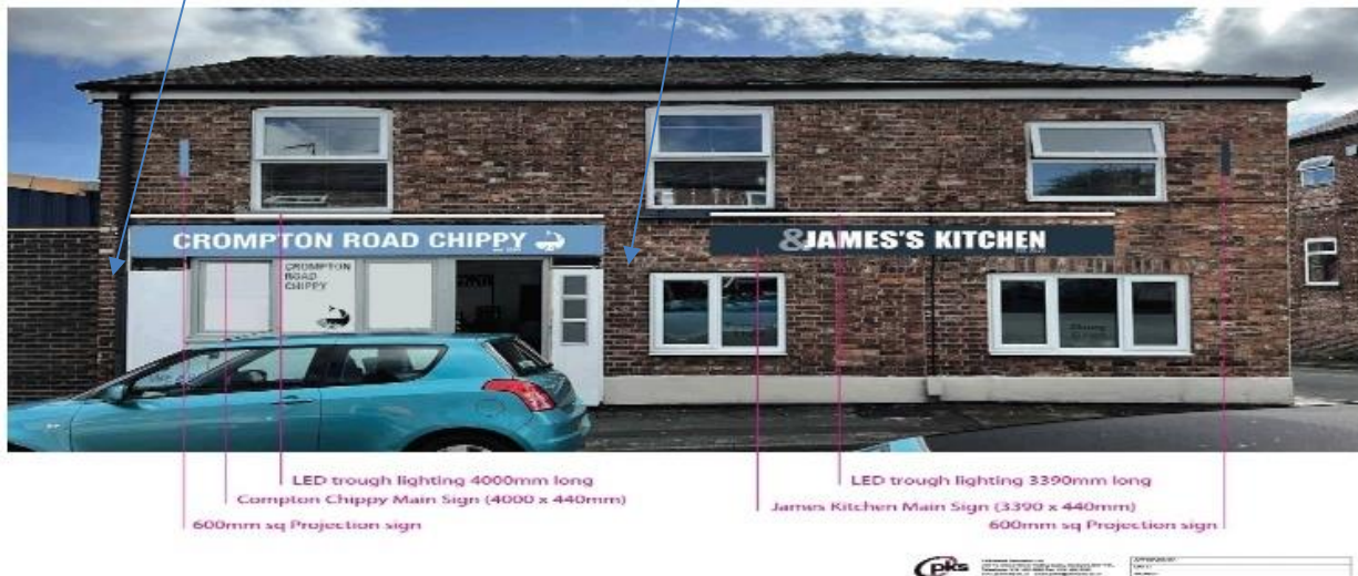
Compton Road Chippy Signage