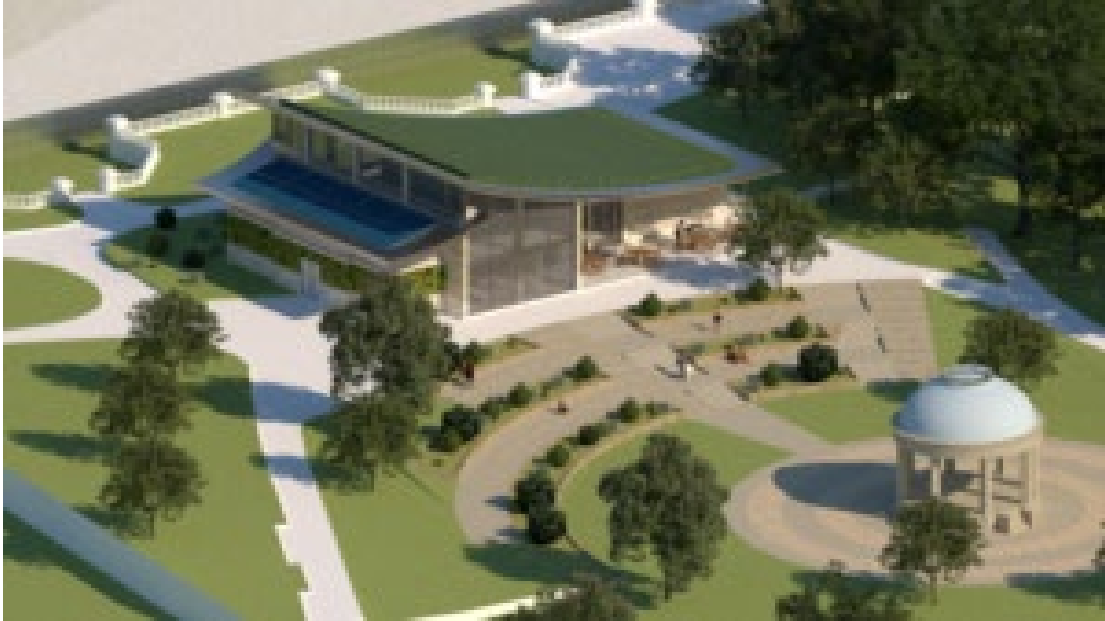
The chosen design view 2