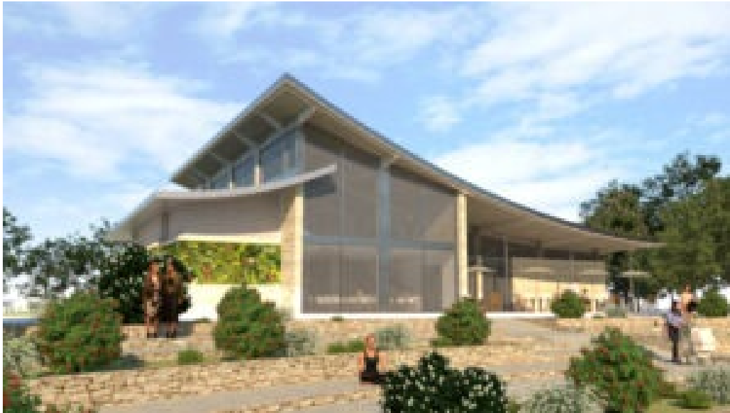
The chosen design