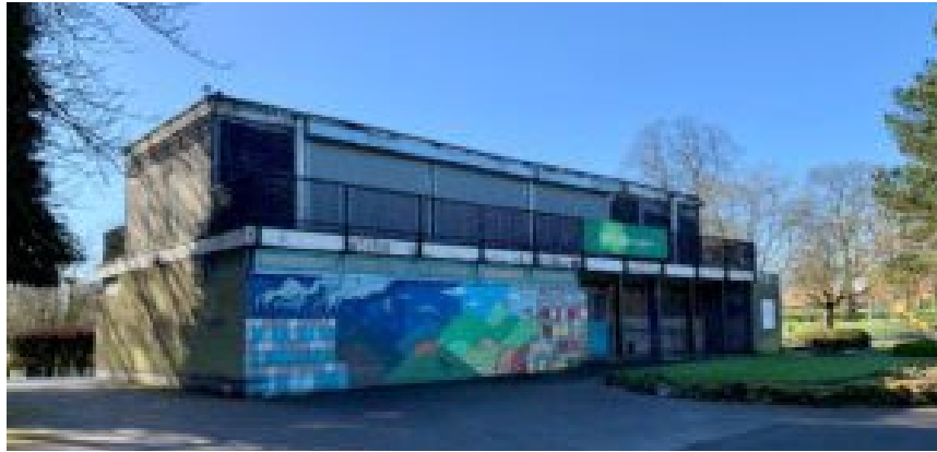
The current building