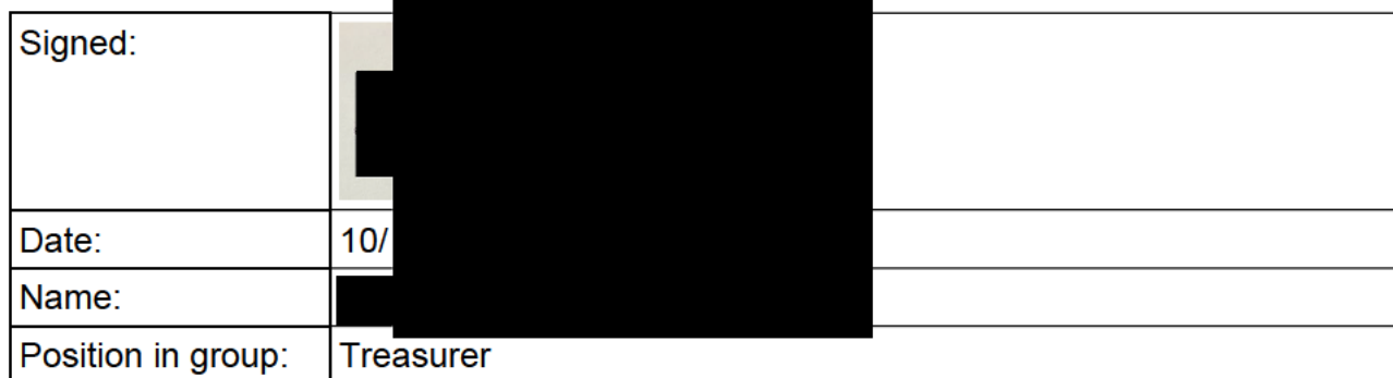
Table 13 Declaration

I confirm that I understand, agree and accept the terms and conditions of this grant as set out in the Grants and Funding Policy.